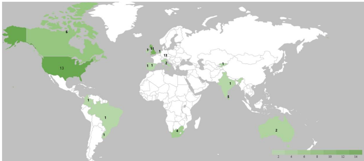
Countrywide Distribution of Sampled Publications

The works reviewed included one book chapter, two conference papers, 53 journal articles, seven reports, and two Ph.D. thesis. Table 1 displays the publication types, frequency, and open access policies for the sampled works.